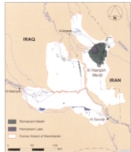
Vanishing Marshlands: 1973 - 2000

Satellite-based assessment studies, carried out by UNEP's Division of Early Warning and Assessment (DEWA-Europe/GRID-Geneva) and covering a period from the early 1970s to 2000, showed that 90 per cent of the marshlands, also home to rare and unique species and a spawning ground for Gulf fisheries, had